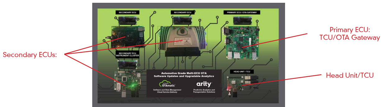
Airbiquity OTA Software and Data Management with Arity Upgradable Analytics Demonstrator

Arity's driving behavior modules provide driver, vehicle, and contextual analytics for a variety of use cases, including usage based insurance, driving behavior, accident prediction, shared mobility analytics, and many others. Arity makes transportation smarter, safer, and more useful by collecting and analyzing massive amounts of data to help partners better predict risk and understand how people move. By balancing edge analytics and cloud processing, Arity is able to capture, process and draw actionable insights from the vehicle in real-time without overburdening data transmission volumes.